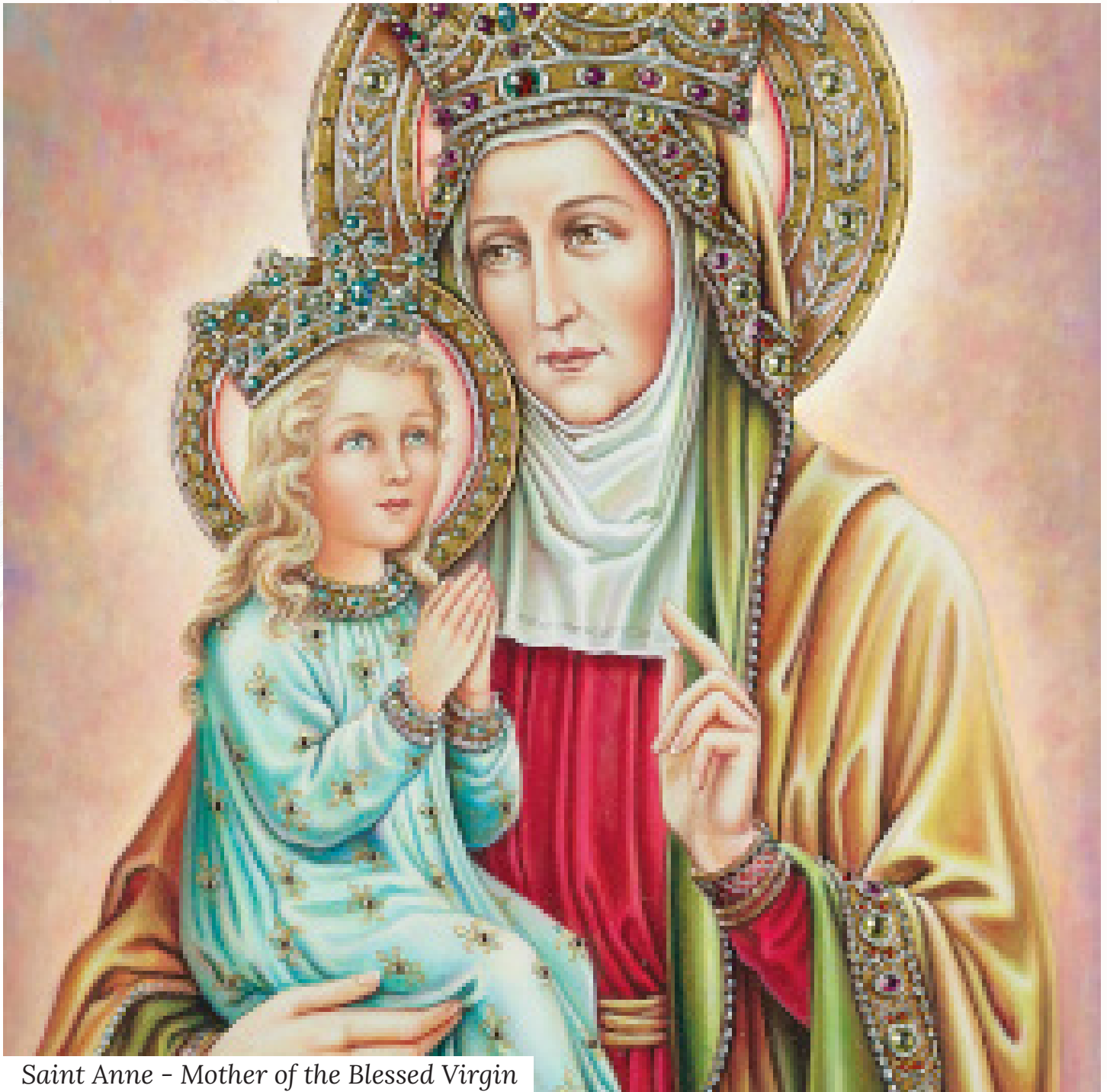
Saint Anne - Mother of the Blessed Virgin